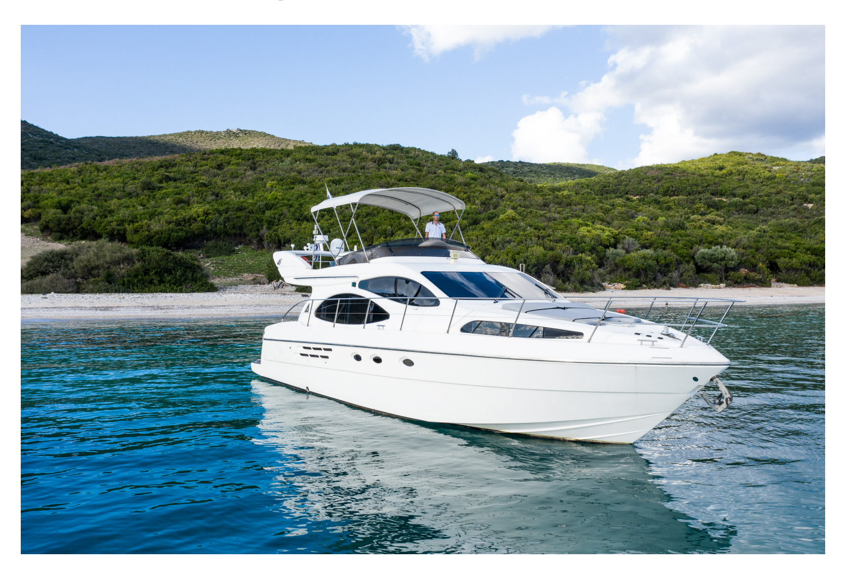
Azimut 46 Fly