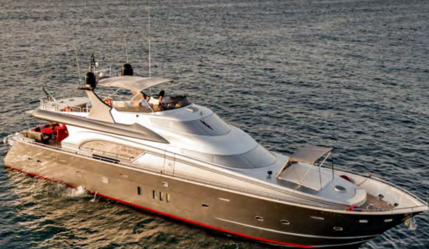
M/Y LADY B DE BIRS – 26 mt.