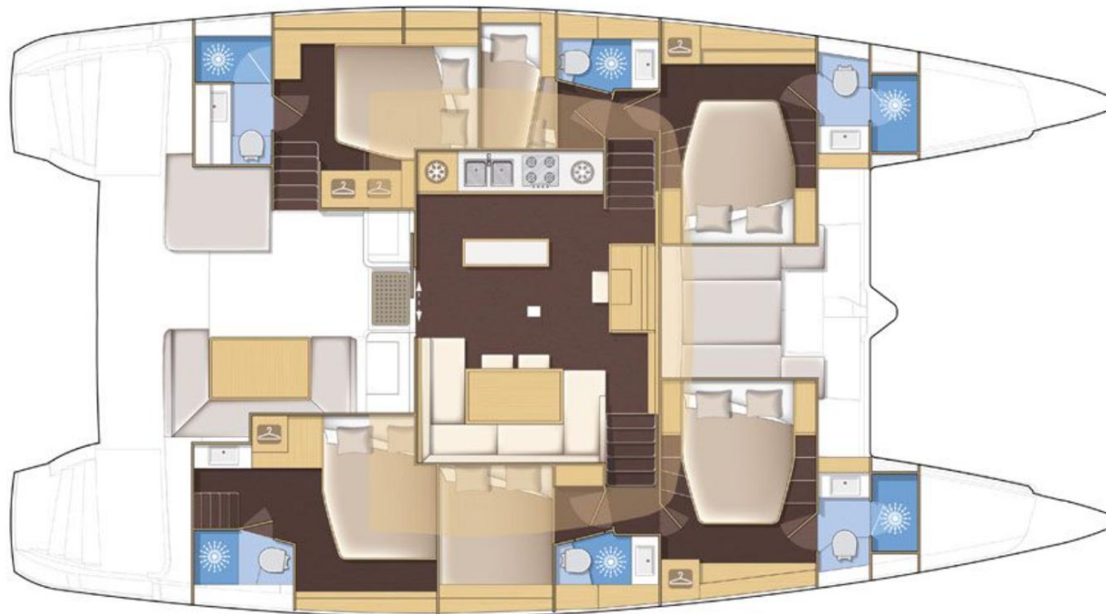
Lagoon 52 version 6 cabines - 6 cabins version