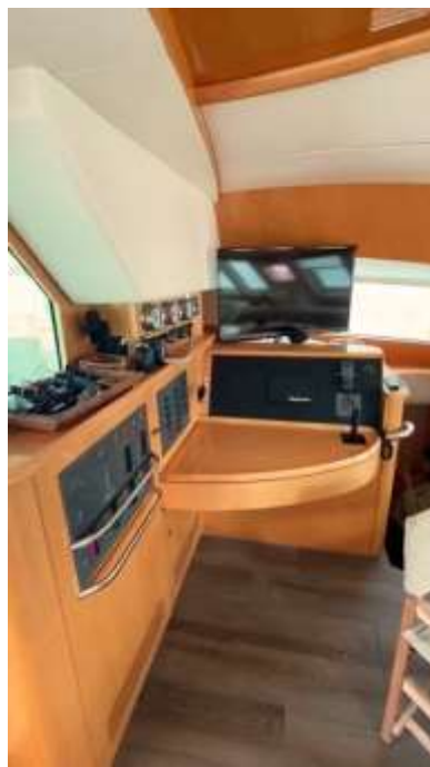
Privilège 615 Chart table