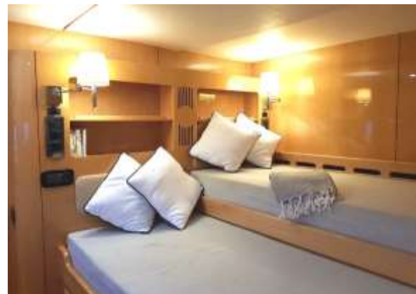
Privilege 615 Cabina VIP dos camas simples, convertibles en doble, en proa estribor