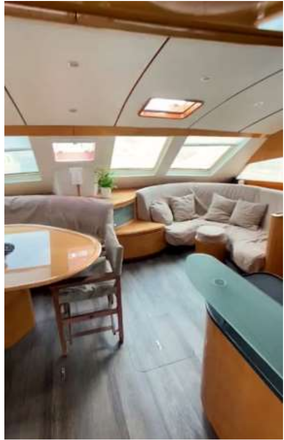
Privilège 615 Living room