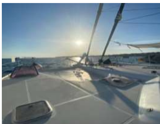
Privilège 615 View from the bow