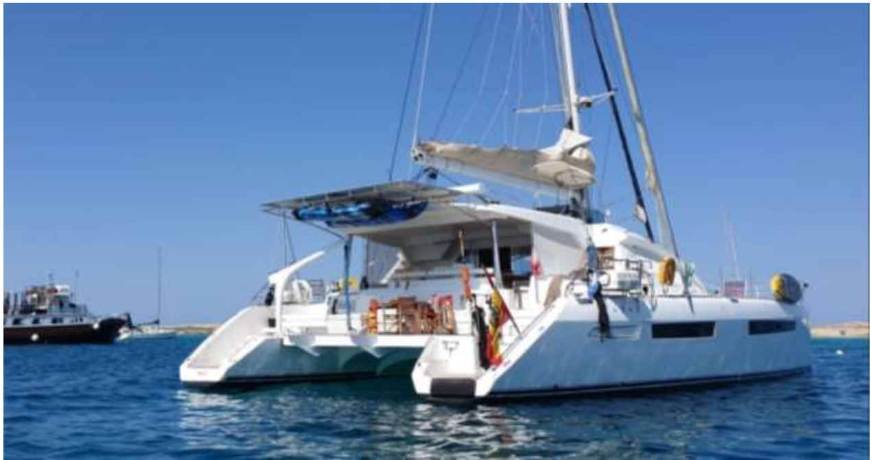
Privilege 615 Anchored, stern view