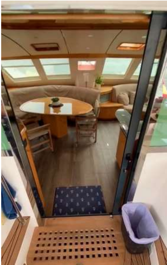
Privilège 615 Living room