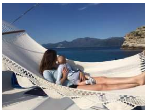
Privilège 615 Relax and comfort in the bow hammock