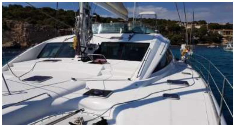
Privilege 615 View from the bow