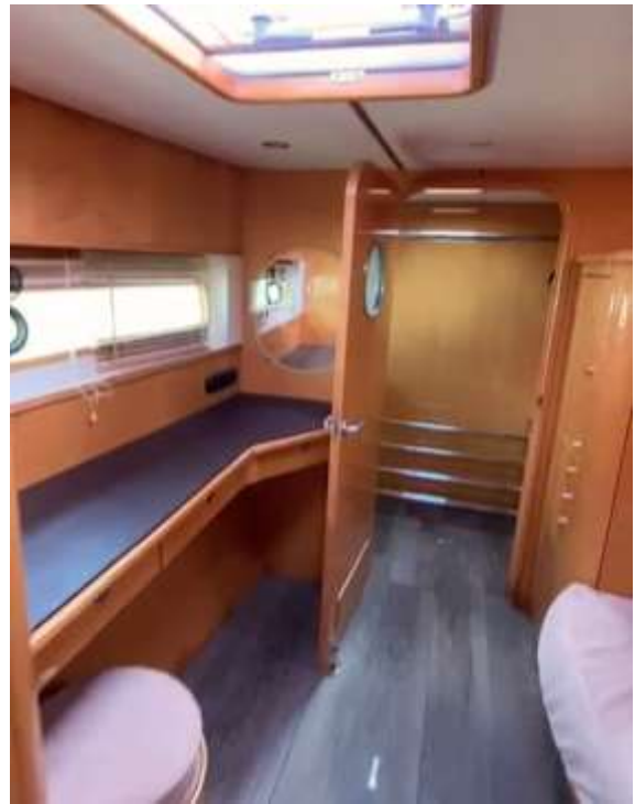
Privilege 615 Dresser and closet of King cabin