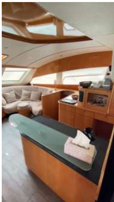
Privilège 615 Bar cabinet