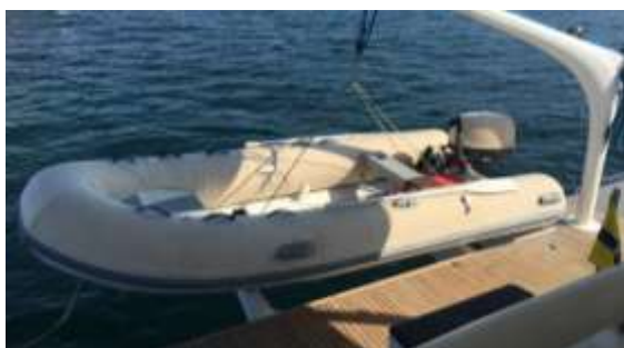
Privilege 615 Auxiliat Highfield 4m / 25cv Yamaha