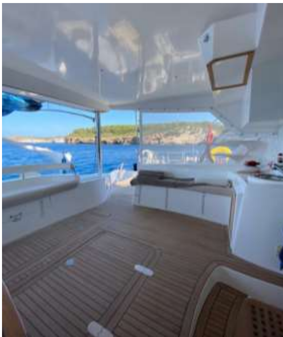
Privilege 615 Cockpit