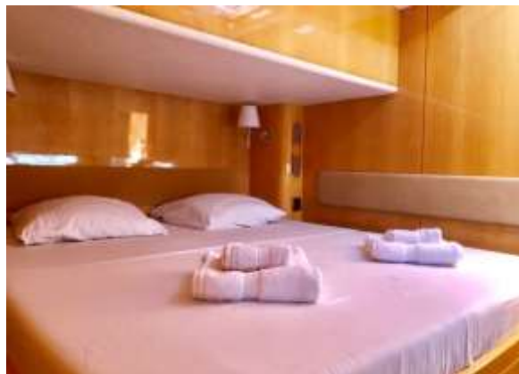
Privilege 615 Queen cabin