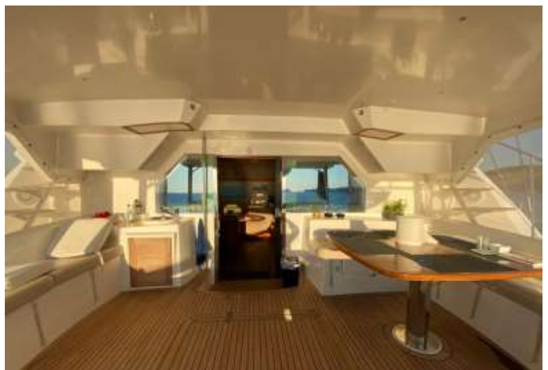
Privilege 615 Cockpit