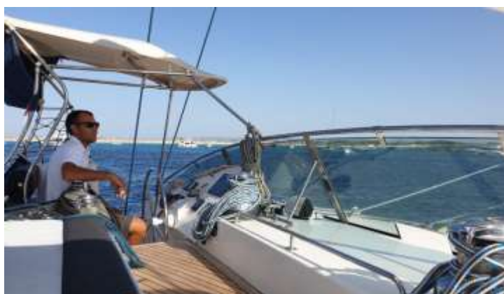
Privilège 615 Flybridge