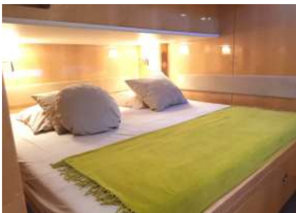
Privilege 615 Queen cabin