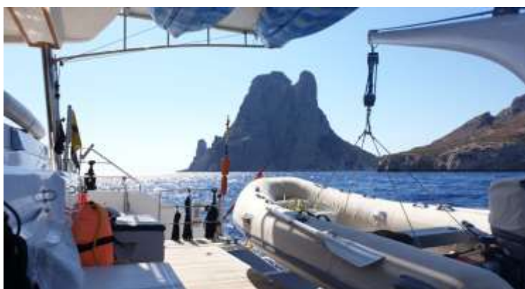
Privilège 615 Stern platform with the auxiliar