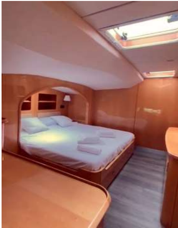
Privilege 615 King cabin