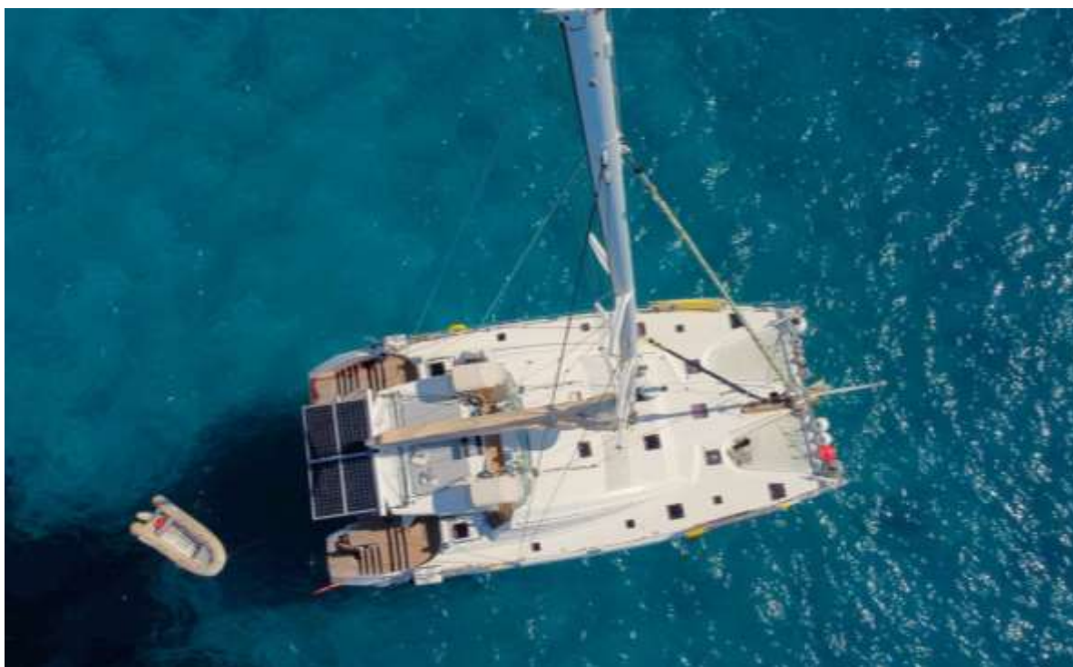
Privilège 615 Top view