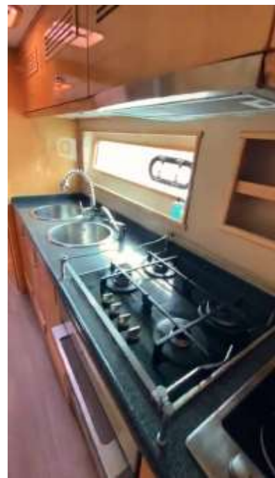
Privilège 615 Kitchen