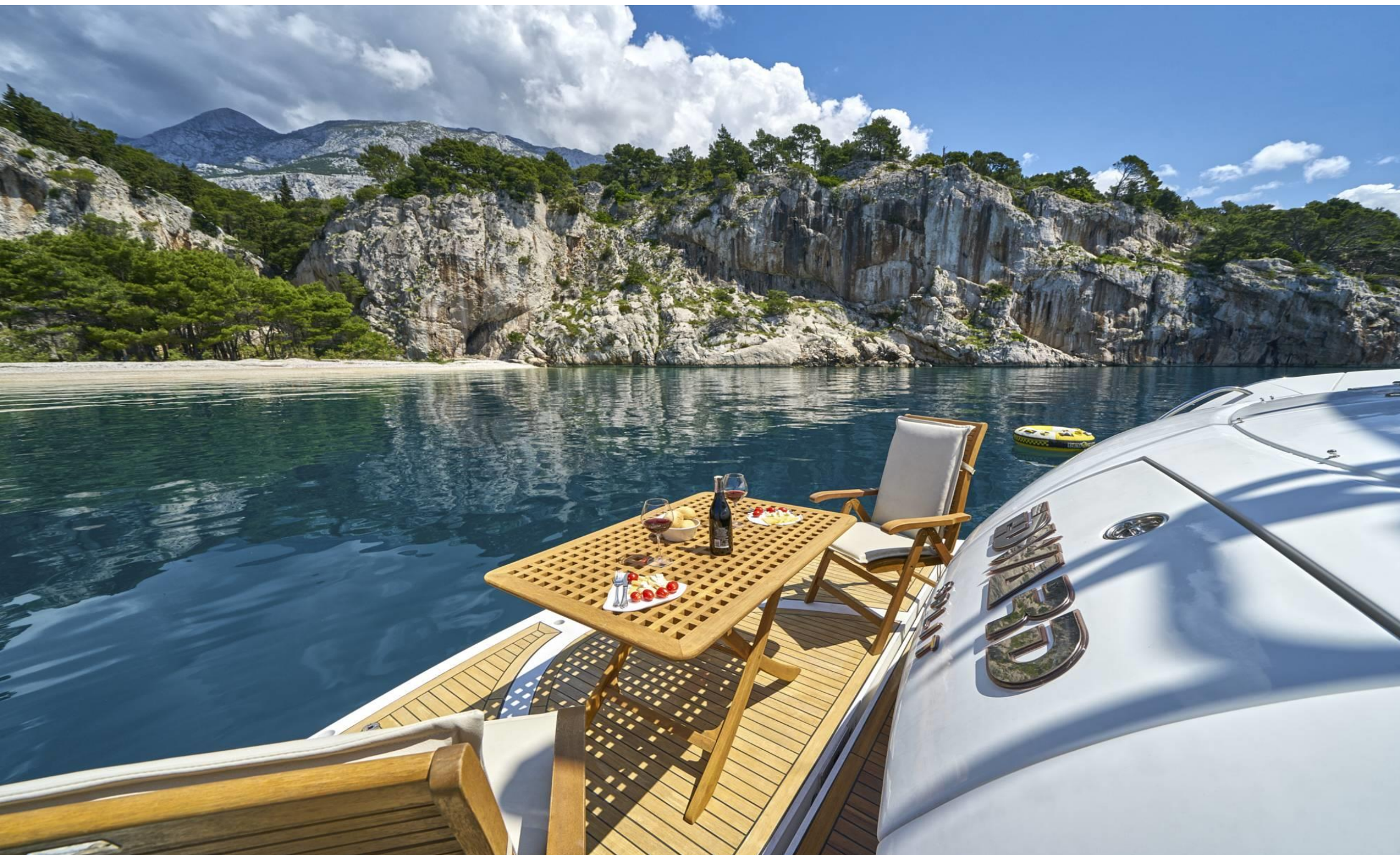
HYDRAULIC BATHING PLATFORM