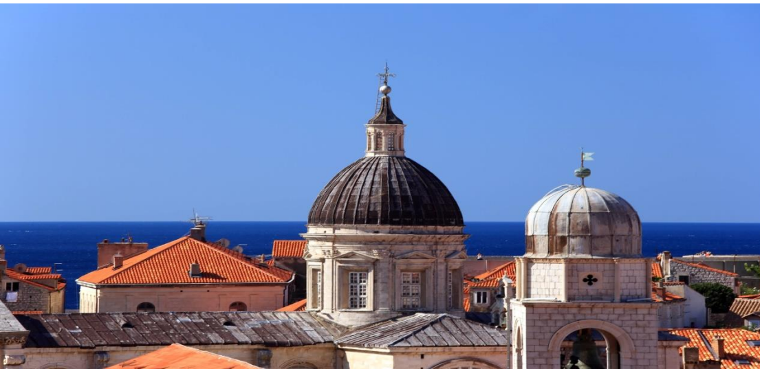
DUBROVNIK - CROATIA

Available for charter on the Adriatic sea, this magnificent Sunseeker Manhattan 64 allows guest to reach an impressive speed of 32 knots. She offers spacious accommodation of 3 en suite guests cabins. The Sunseeker Manhattan 64 enjoys excellent views from the upper lounge, also a large lounge, kitchen and a well equipped bar. In the aft area, the hydraulic swimming platform offers sea access. It has all the equipment worthy of a luxury yacht, including air conditioning, smart TV/DVD, upgraded audio system and various watersports equipment. Explore beautiful Adriatic and the best hidden gems in Croatia