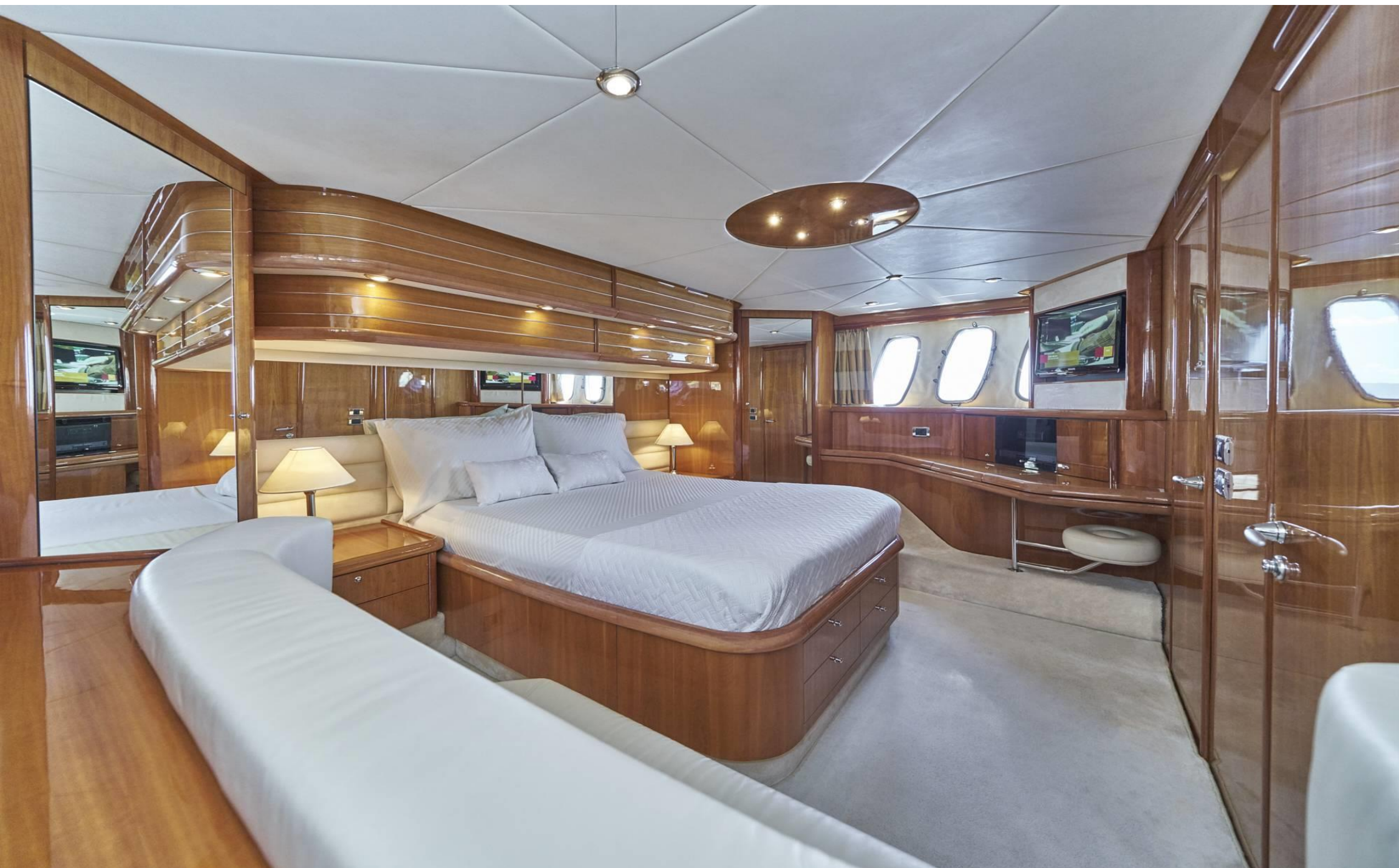
MASTER CABIN 1