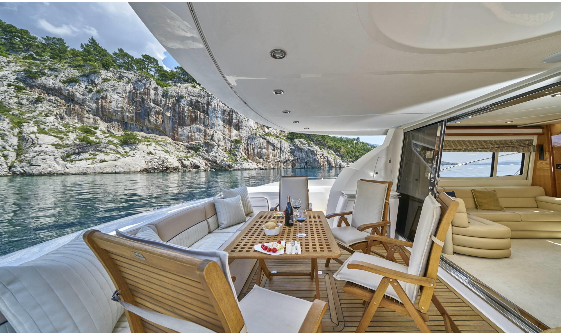
STERN OF M/Y EDWARD