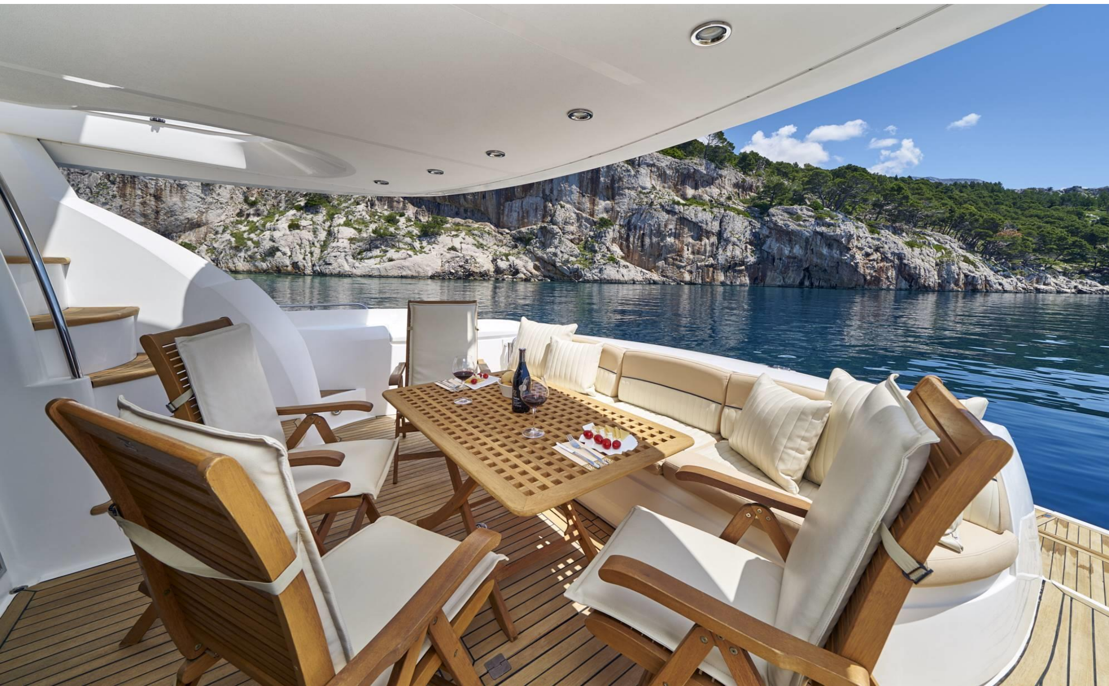
STERN DINING AREA