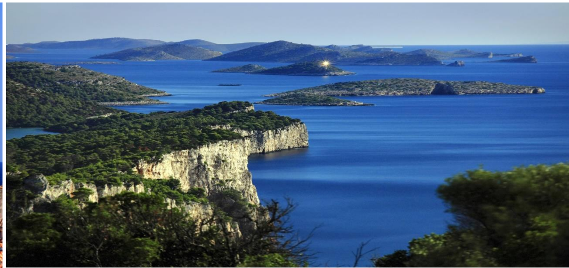
KORNATI - CROATIA