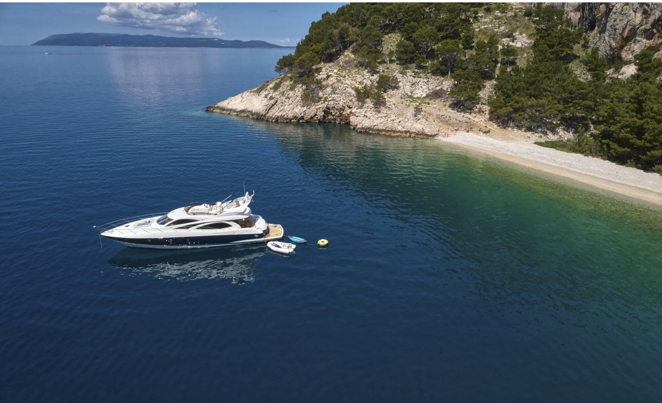
M/Y EDWARD AT ANCHOR