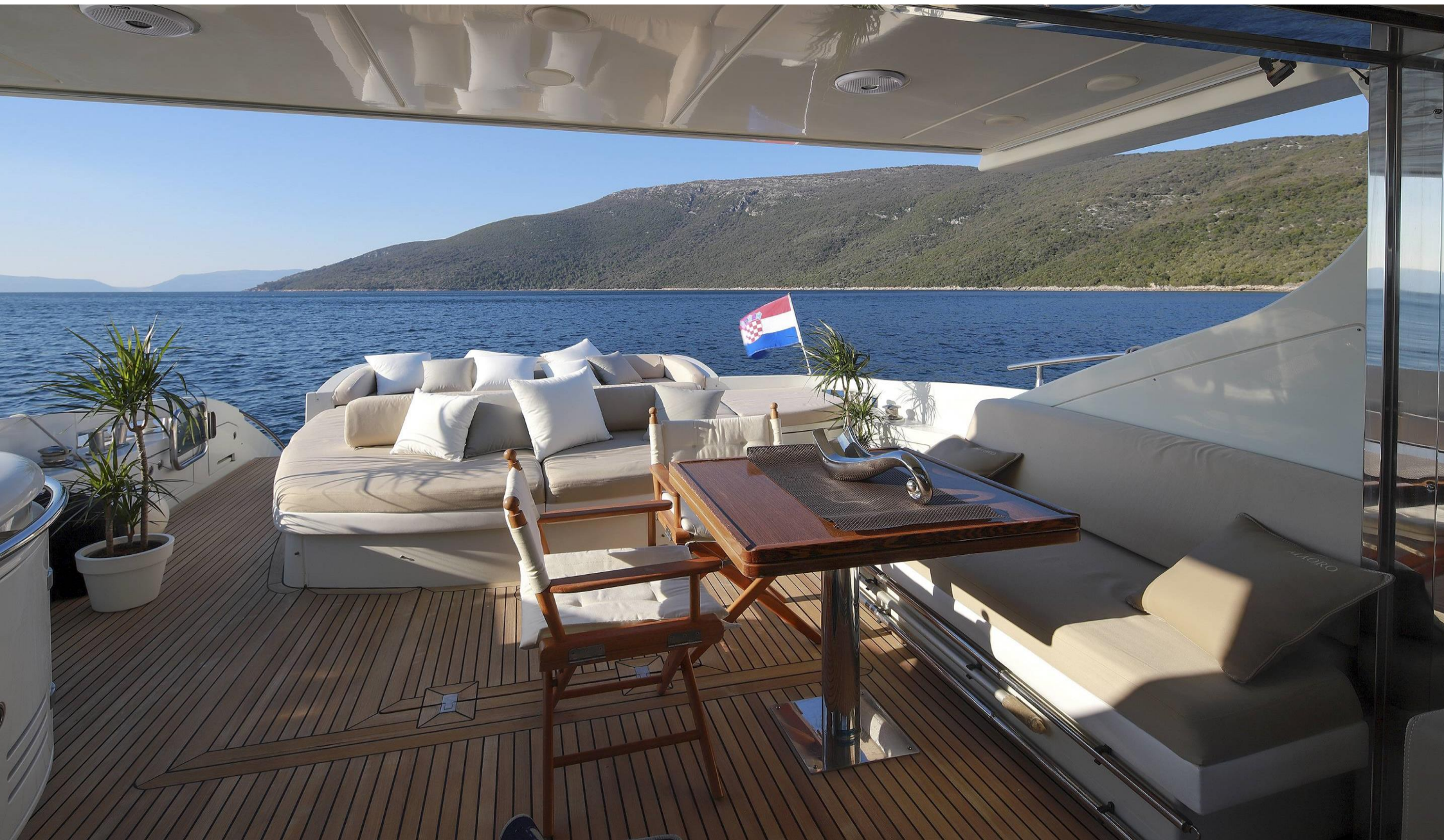
STERN LOUNGE AREA