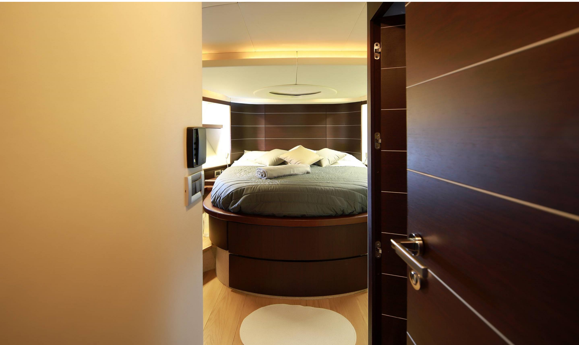
ENTRANCE TO THE VIP CABIN