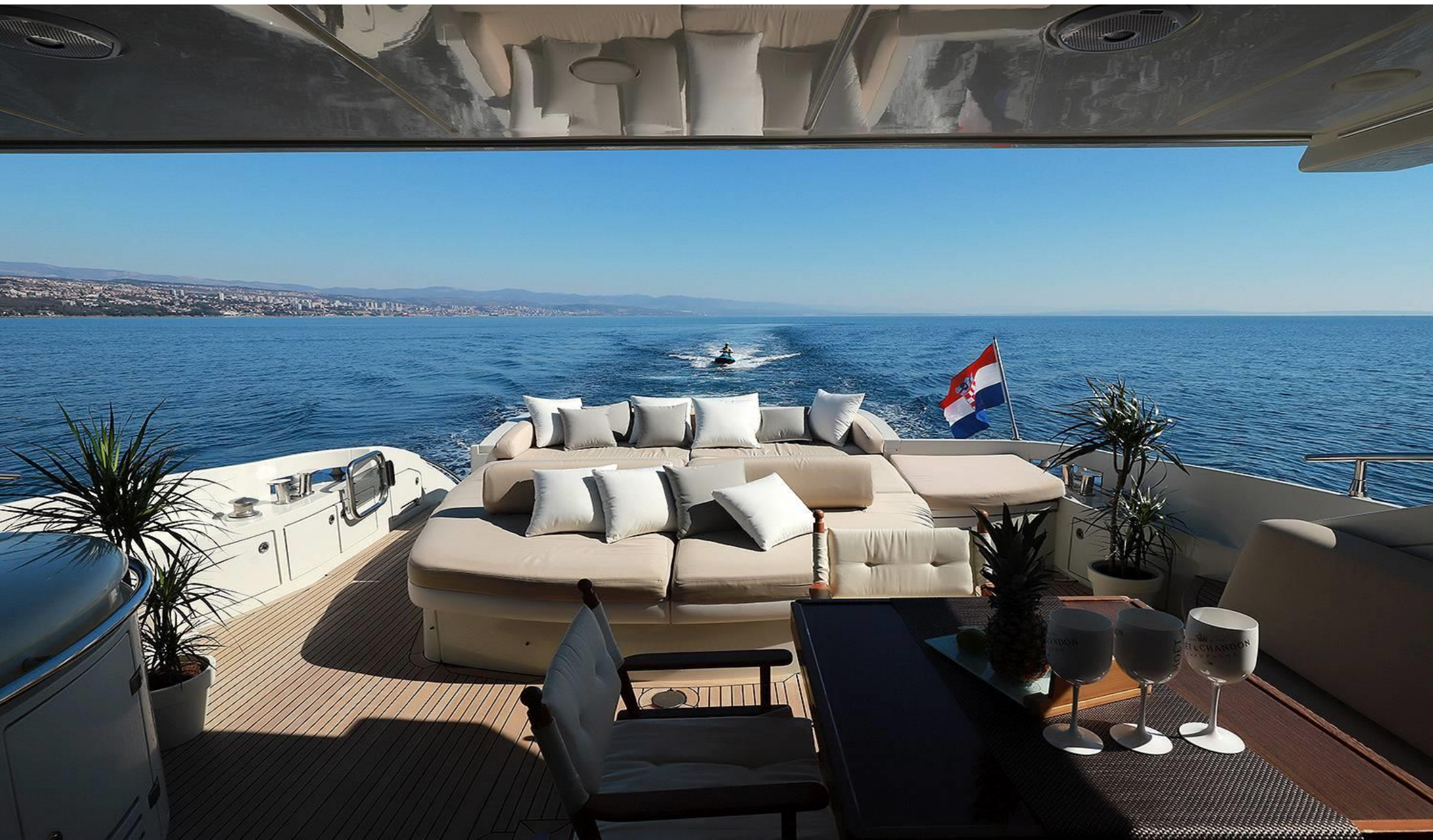
STERN OF THE YACHT