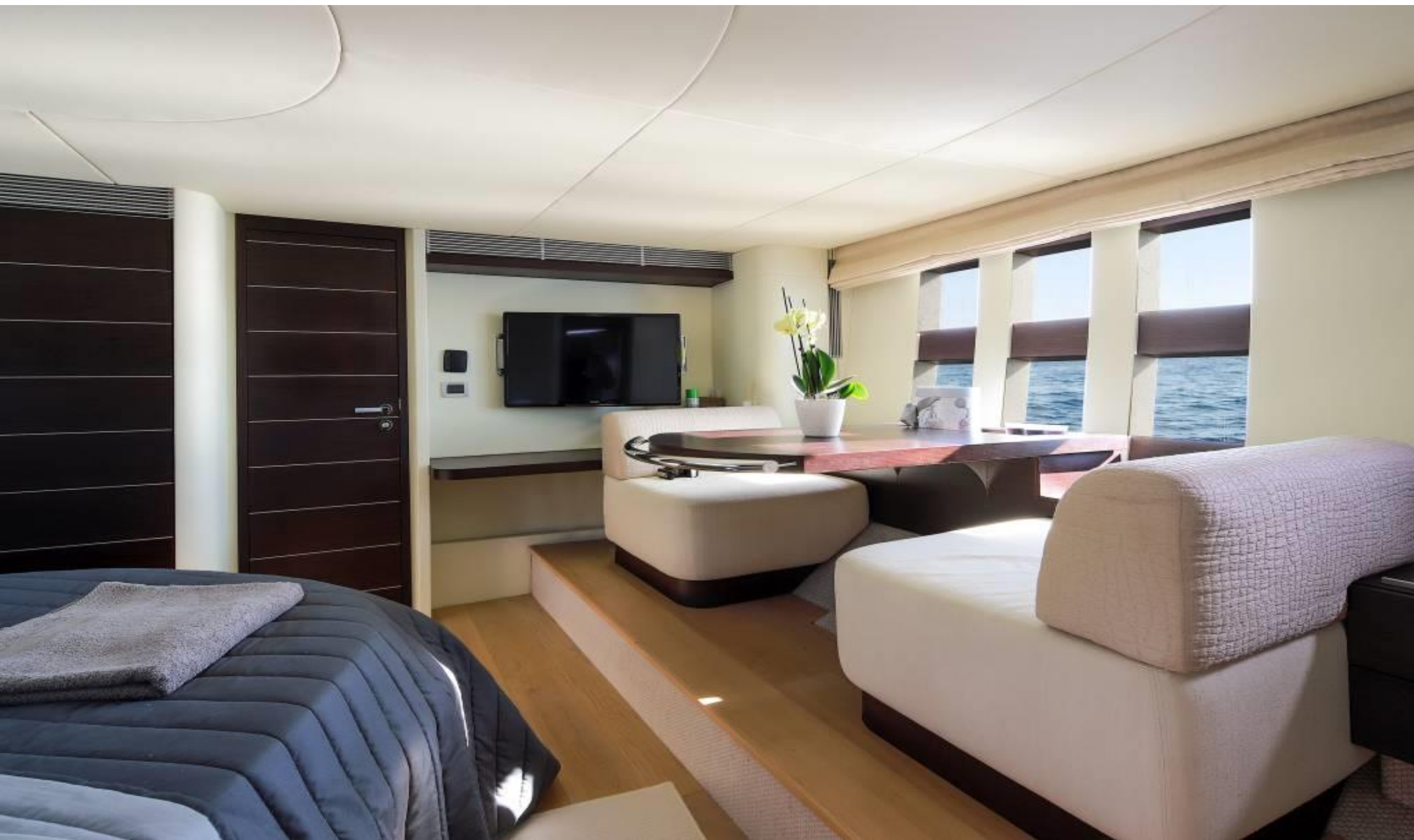
SIDE TABLE IN THE MASTER CABIN