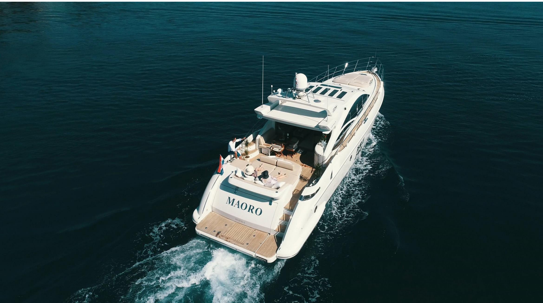
M/Y MAORO CRUISING