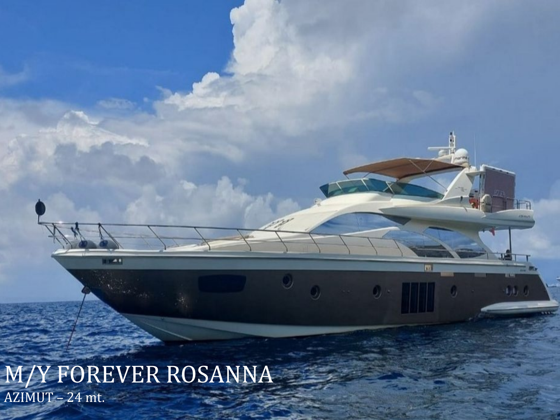
M/Y FOREVER ROSANNA AZIMUT – 24 mt.