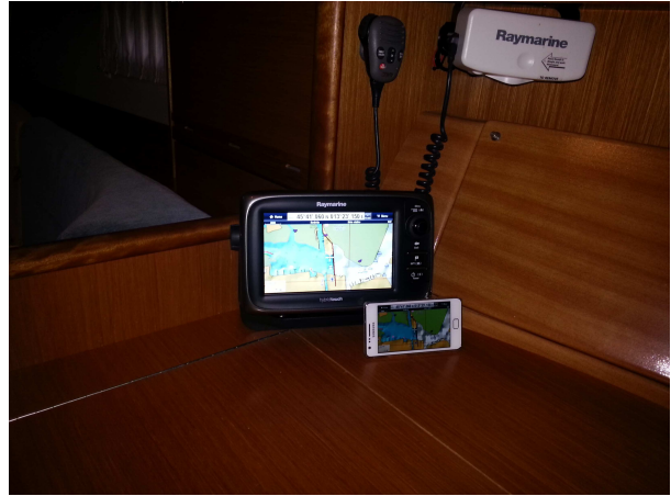
Cartographic gps touch screen connectible with smartphone/tablet