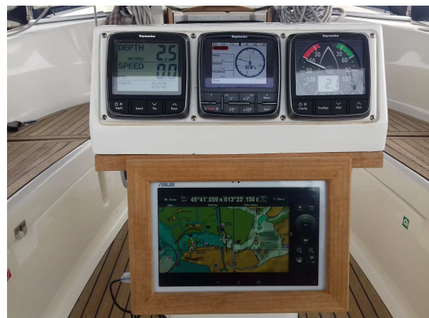
Sounder, autopilot, wind, chartplotter