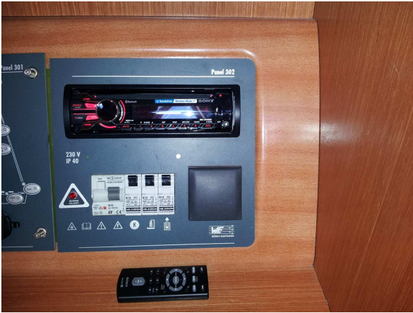
Radio with remote control, aux, cd, bluetooth